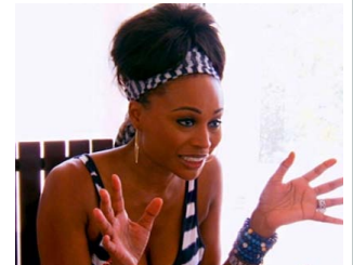
'Real Housewives of Atlanta' recap, 'Hold on to Your Weaves'