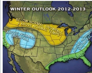
AccuWeather calling for snowy winter ahead